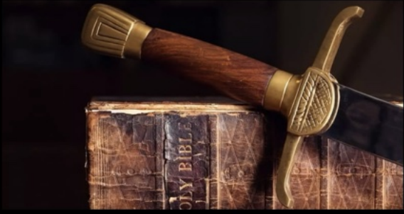
Sword that pierces (Hebrews 4:12-13)