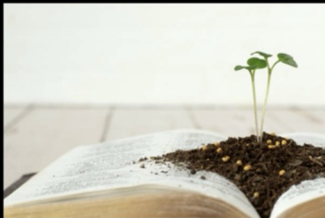
Seed that grows (1 Peter 1:23)