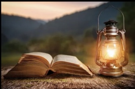
Lamp that shines (Psalm 119:105)