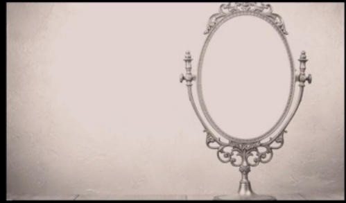
Mirror that reveals (James 1:23)